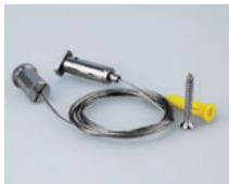
Suspension Cable (SP)