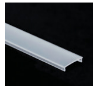
Frosted Lens (FR)