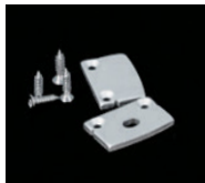
End Caps (EC)