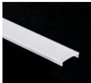
White Lens (WH)