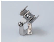
Pivot Mounting Clip (PV)