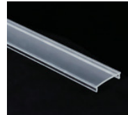
Clear Lens (CL)