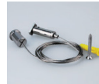
Suspension Cable (SP)