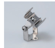
Pivot Mounting Clip (PV)