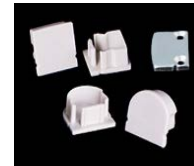
Square End Caps (SEC) Flat End Caps (FEC) Round End Caps (REC)