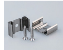
Metal Mounting Clip (MT)