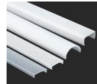
Frosted Flat Lens (FRF) White Flat Lens (WHF) White Round Lens (WHR) White Square Lens (WHS)