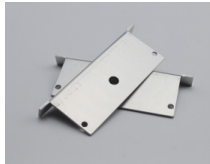
End cap with hole End cap without hole