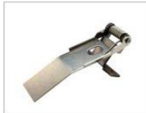
Mounting clip (CP)