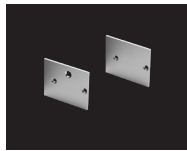
End Caps (EC)