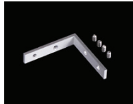
90° Connector (B)