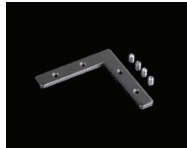
90° Connector (A)